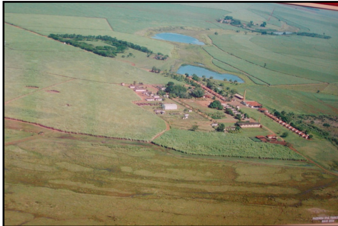
Aerial view of the whole farm